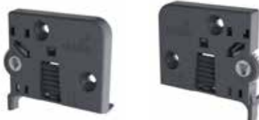
Quadro tilt adjustment