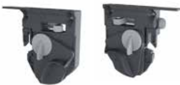
Catch for wooden drawer